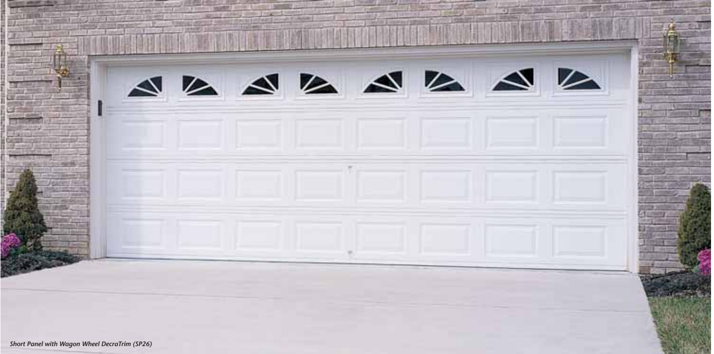
Short Panel with Wagon Wheel DecraTrim (SP26)

When it comes to ultimate protection, the Olympus stands tall. With triple-layer construction, thermal breaks, and a superior insulation R-value of 15.67, this durable, low-maintenance door gives you the ultimate in quiet operation and energy efficiency.